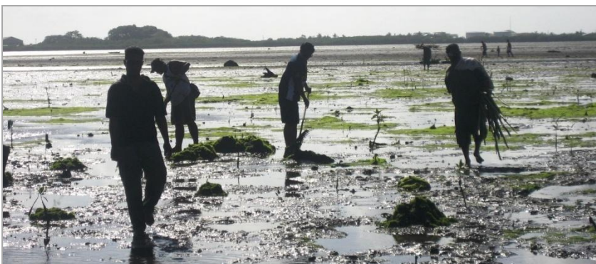
Promoting traditional fishing practices