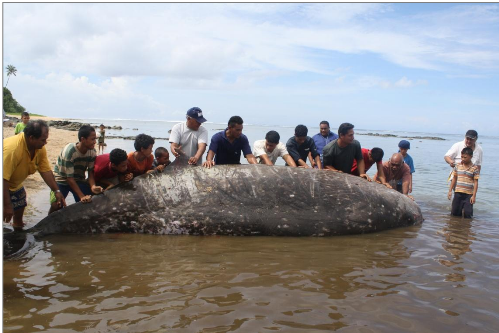
Cuvier's Beaked Whale stranded at Utulaelae village, 2010