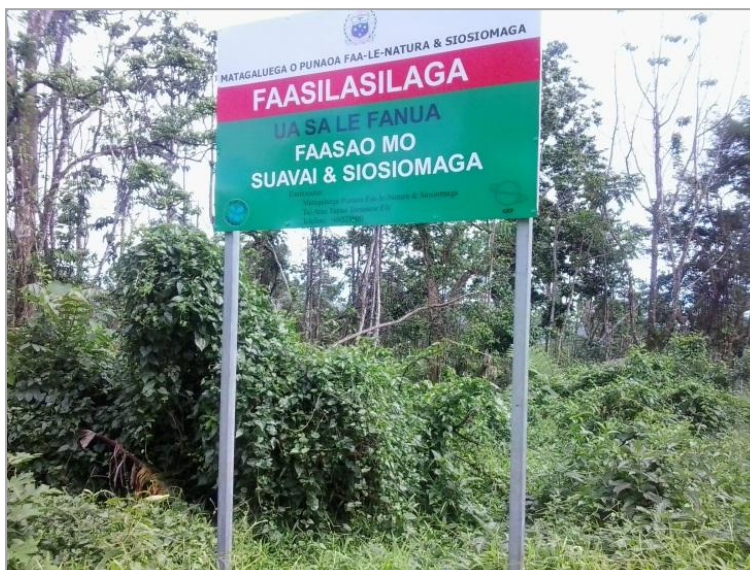
Conservation efforts under the IWRM Project targeting upland forest and catchments areas