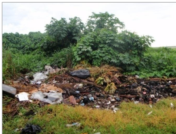
Illegal dumping along the road to the Mulifanua wharf