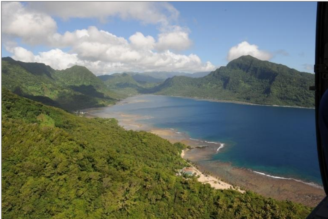
Fagaloa Bay - Uafato/Tiavea Conservation zone