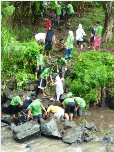
River clean-up campaign around Upolu