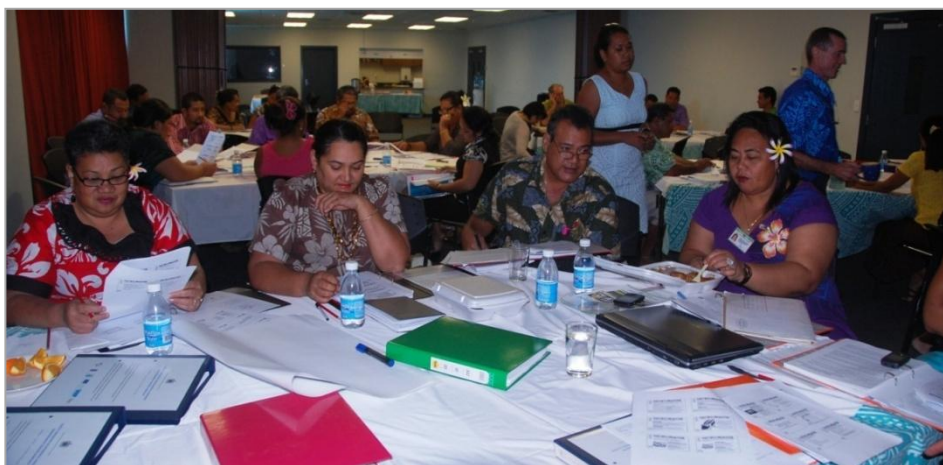
MNRE/Stakeholders Integrated Environmental Assessment Workshop for the SOE Review Plan, 2011