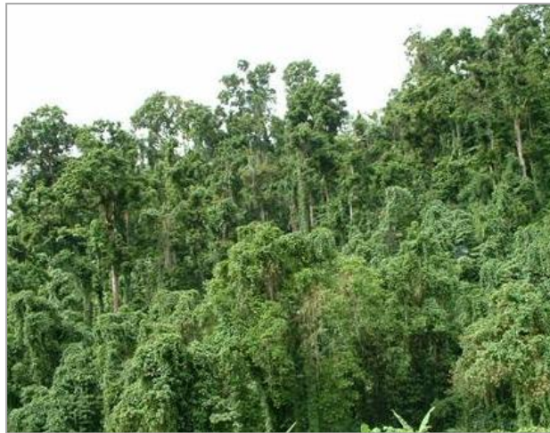
Widespread of the Merremia vines in the coastal and lowland habitats