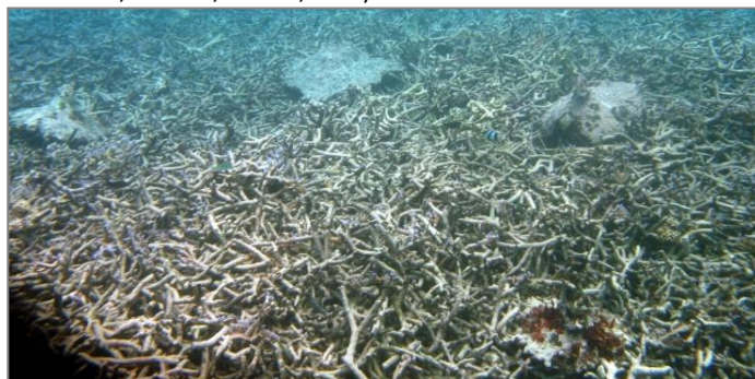
Degraded coral reef, Lalomanu, 2012